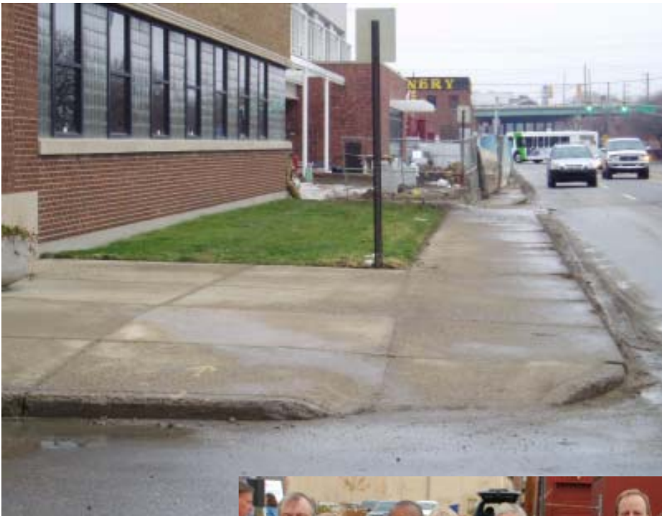
BEFORE: Flooding/puddling on Ohio Street & Park Avenue. New rain garden is being installed in the grass area.