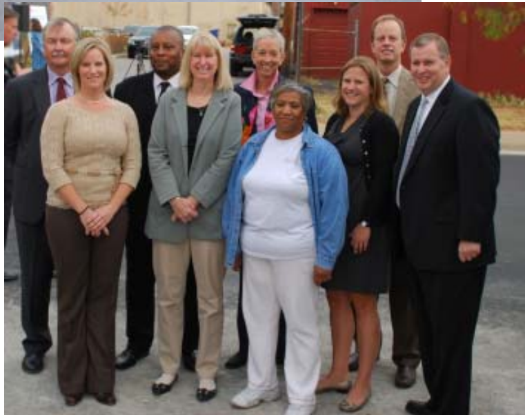
START: October 2010 news conference to announce Ohio Street improvements - part of RebuildIndy.